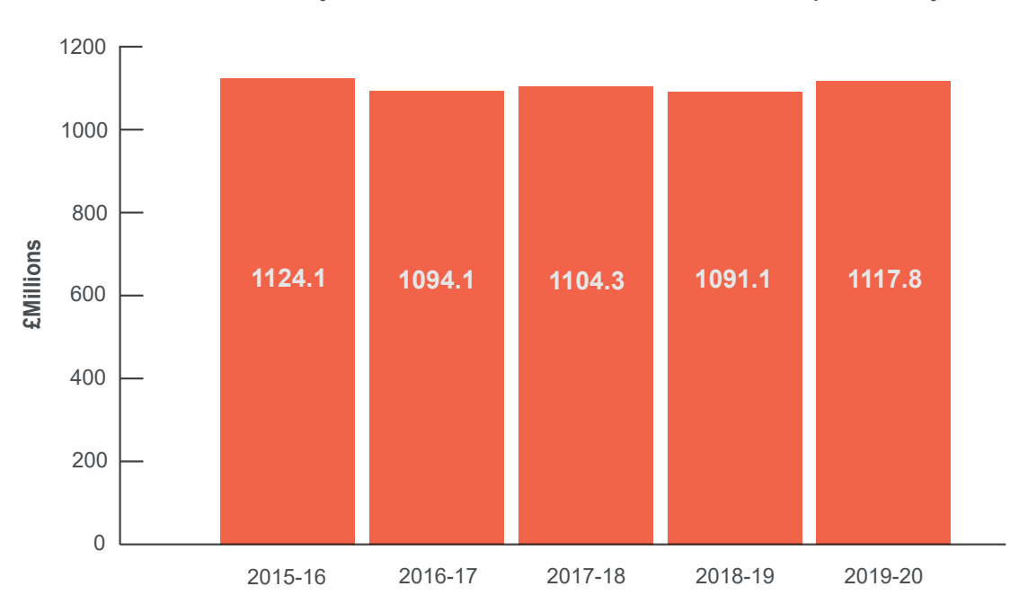
Exhibit 2: amount of usable reserves as a percentage of net cost of services over time

All Wales total for unitary authorities, Total usable revenue reserves not protected by law